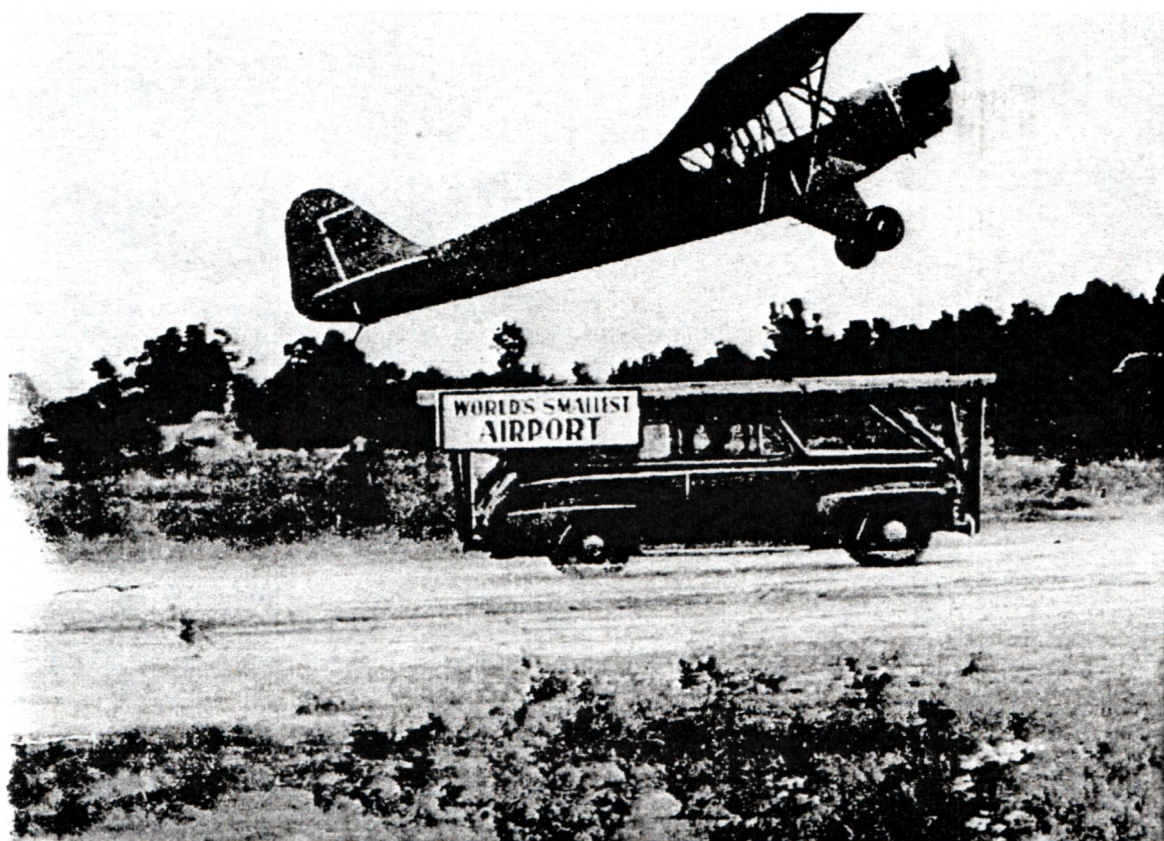
An airdrome in miniature is this wooden platform atop a car; it serves as a landing strip for the Piper Cub flown by the Thrasher Brothers Aerial Circus of Elberton, Ga.